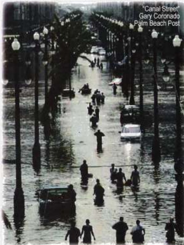
'Canal Street'

First Presbyterian Church responded to the catastrophe of Hurricane Katrina with volunteers and monetary support - offering strength for others' journey.