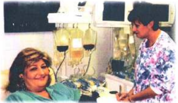
FPC provides ongoing support to the Blood Bank Program

This increase will help provide additional support to countless local and global outreach projects.