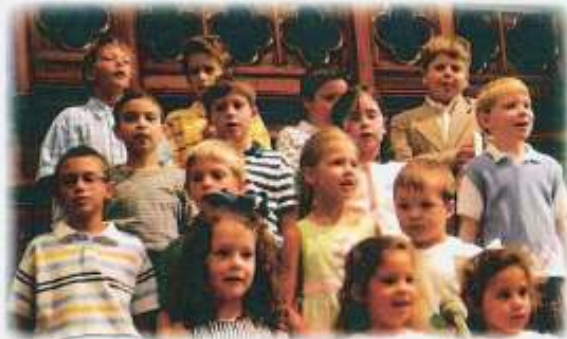
At FPC Children learn through various methods during Cross Walk

FOCUS: Increase average commitment from $3,802 to $4,040