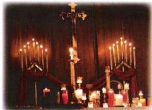
Taizé Prayer Service