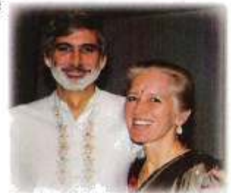
Bangladesh Medical Missionaries

Missionary presence in Guatemala Bangladesh South Africa